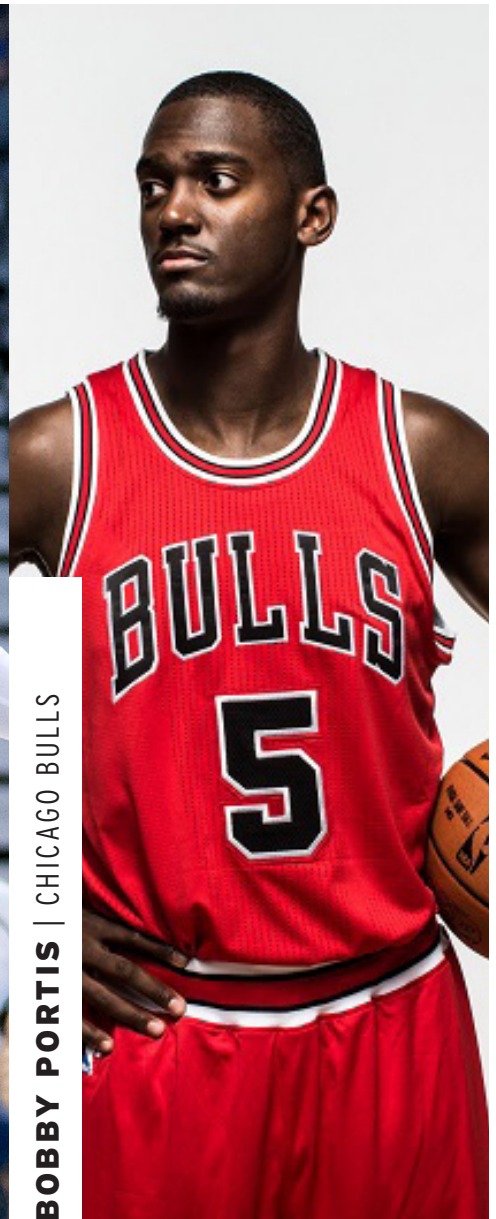
BOBBY PORTIS | CHICAGO BULLS