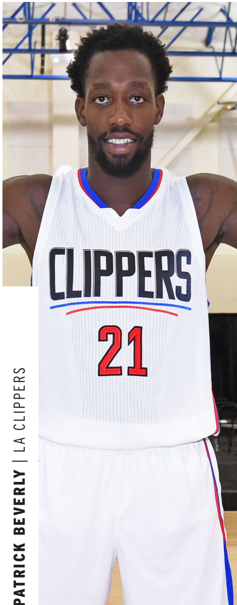
PATRICK BEVERLY | LA CLIPPERS